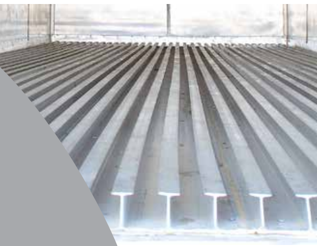
ALUMINUM T GRATING FLOOR