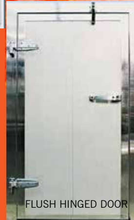
FLUSH HINGED DOOR