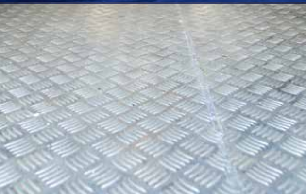
ALUMINUM CHEQUERED SHEET FLOOR

KOOL KARGO® insulated vehicle bodies are based on proven and well researched technology and construction techniques. The panel thickness up to 150 mm can be provided to suit varying needs of temperature maintenance (-25 °C to +15 °C).